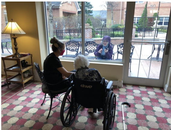
Visiting through the glass from the Courtyard of Mother Angeline McCrory Manor in Columbus, Ohio