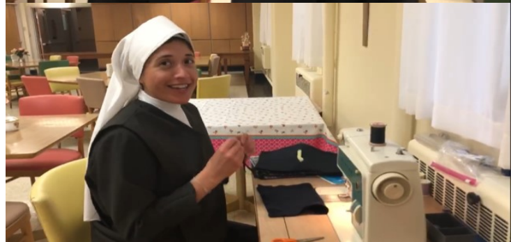
Sisters at our Motherhouse assist in making masks for our facilities.